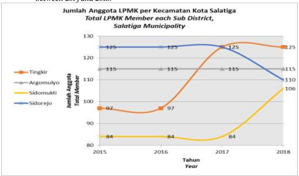
Table 1. Number of LPMK members in each sub-district of Salatiga Municipality between 2015 and 2018.

Salatiga, the statistic result is dynamic within the period of 2015-2017. Based on the statistical report of Salatiga, the dynamic is shown in the following table: