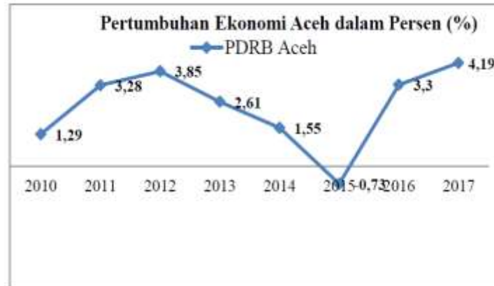
Aceh Economic Growth 2010-2017 in Percent (%)

Source: Central Bureau of Statistics (2017)